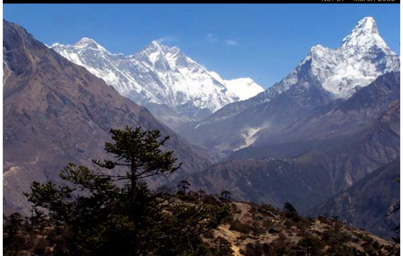
Spectacular views of Chomolungma (Everest), Lhotse, and Ama Dablam in Sagarmatha National Park, Khumbu Region of Nepal