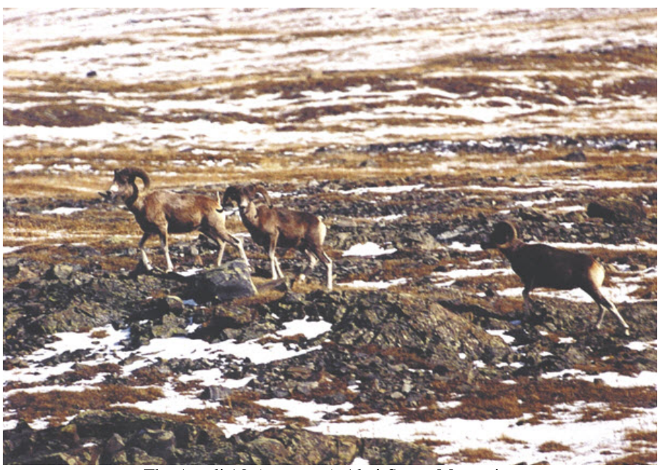
The Argali ( Ovis ammon ), Altai-Sayan Mountains

There are many threats to the natural heritage of the Ecoregion, including poaching and illegal trading in flora and fauna, infrastructure development, habitat destruction and deforestation, pollution and the threat of climate change. Climate change is a major issue. Records maintained by the Russian Hydro-meteorological Service report identify an increase in average temperatures since 1970 of 1.5 C consistent with global warming and glacial reduction is clearly evident in the