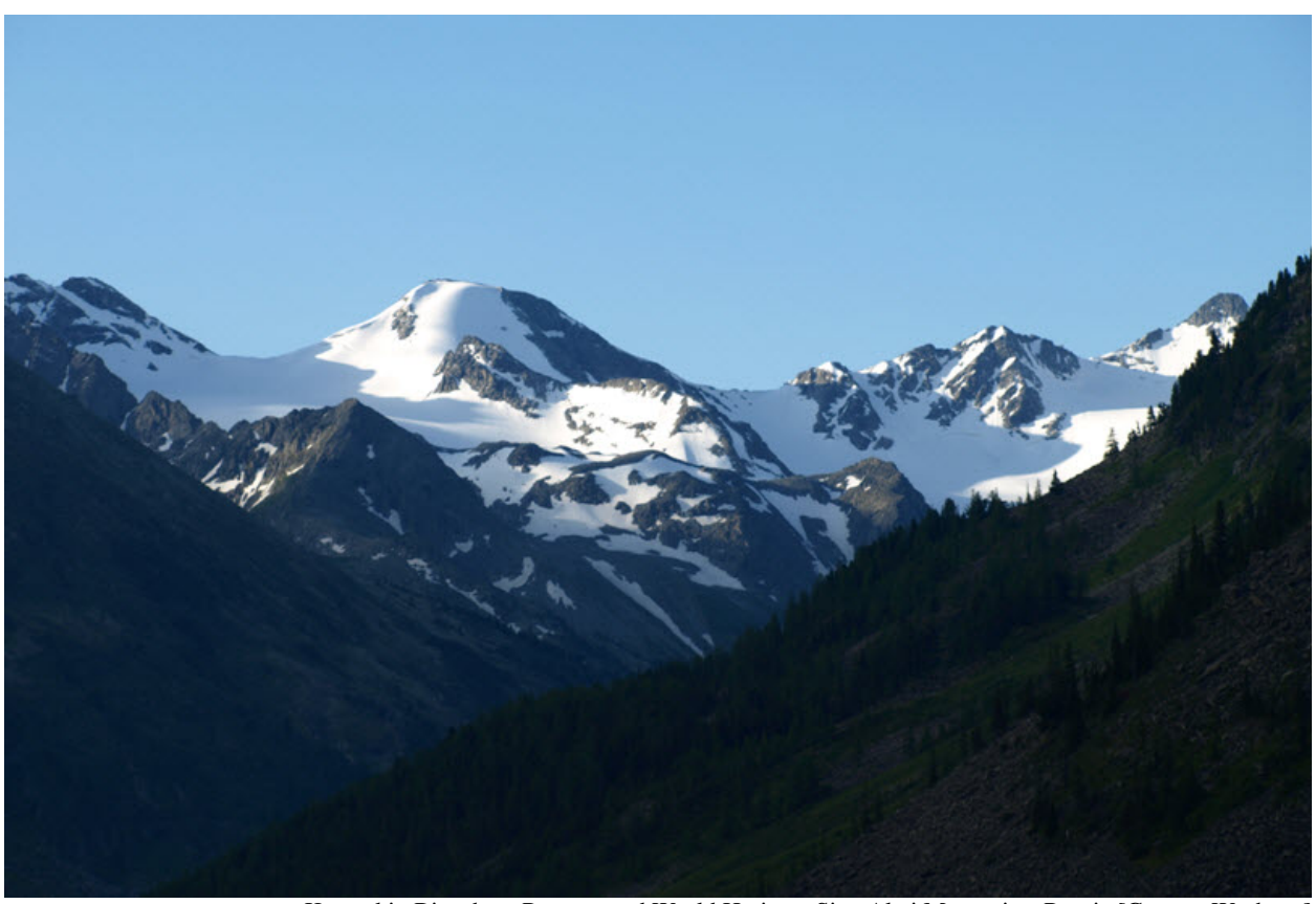
Katunskiy Biosphere Reserve and World Heritage Site, Altai Mountains, Russia [Graeme Worboys]