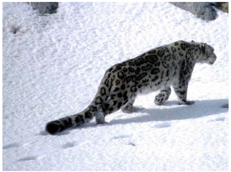
The snow leopard ( Uncia uncia ), Altai-Sayan Mountains