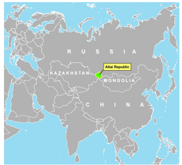
Map One: Location of the Altai-Sayan Ecoregion and Altai Republic, Russia

They are located in the "heart of Asia", and form the headwaters of many rivers including two of the 10 largest rivers of the world, the mighty Russian Ob and Irtish Rivers which flow from the Altai Mountains (southern Siberia) to the Arctic Ocean. The spectacular mountain landscapes include high mountain peaks including Mount Belukha, the highest mountain in Siberia (4506 metres) with its 169 glaciers that extend over 280 square kilometres, glacial lakes, and deep glacial carved valleys and the headwaters of the river Katun, a tributary of the Ob River (Yashina 2008). The Altai-Sayan area is recognised as one of WWF's critical Global 200 Ecoregions (WWF 2009a). An Ecoregion is defined as a large area of land or water that contains a geographically distinct assemblage of natural communities that (a) share a large majority of their species and ecological dynamics;(b) share similar environmental conditions, and;(c) interact ecologically in ways that are critical for their long-term persistence (WWF 2009b). WWF states for the Altai-Sayan that: